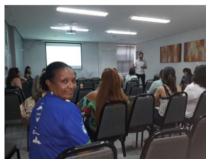
Right: Scoping of new clients.