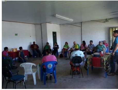
Above: Meetings and collective decision-making processes.