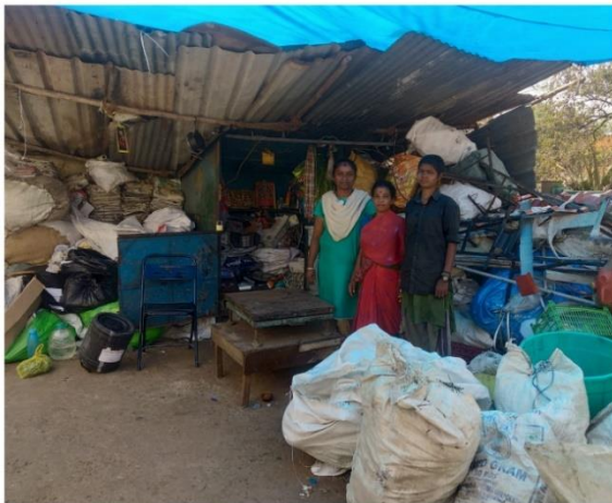
Identified scrap shop owner: Durga's Scrap Shop Location: Bengaluru, India