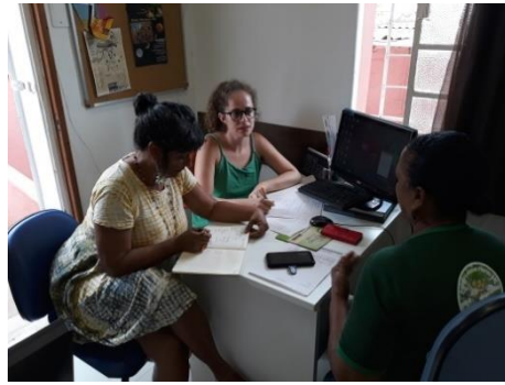
Above: Meetings with partners.