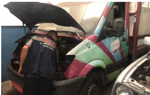
Left: Maintenance of the truck.