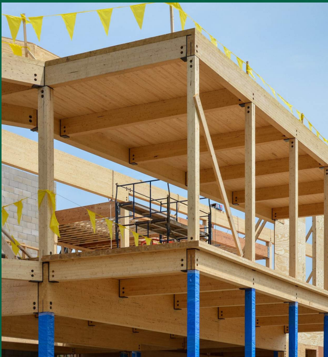
R.W. Kern Center in Hampshire College, Amherst, MA during its construction. The Kern Center is the 17th certified Living Building in the world.

Because MT has competitive advantages for construction of 6-12 story buildings, it is especially suited for high quality, affordable, aesthetically uplifting, and dense