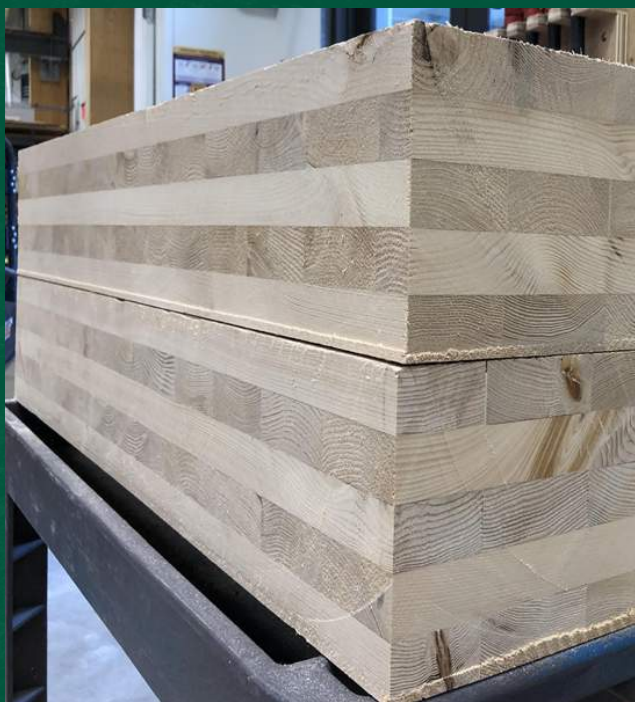
5-layer Eastern Hemlock CLT panel fabricated in University of Massachusetts Amherst's Wood Mechanics Lab.

A portion of the region's MT buildings can be constructed from wood harvested and manufactured regionally. The four-state region's supply of wood is from hundreds of thousands of woodlots owned mostly by local landowners, and harvesting is supported by thousands of loggers, more than a dozen larger sawmills, and scores of local smaller mills throughout our region. However, while these local sources are readily available, MT used in construction in the Northeast U.S. is currently fabricated in Europe or in other parts of North America. Bringing that construction home and using local wood for MT would help support local economies, yield jobs, and encourage a close connection between a well-managed forest, housing in regional cities and a tool for climate mitigation and resilience. Currently, there is great interest among forest landowners and consumers in tangible ways to participate in actions to reduce climate impacts.