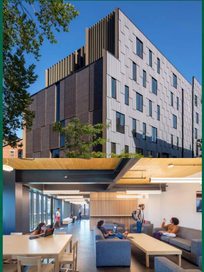
Rhode Island School of Design's North Hall, opened in 2019 with a cross-laminated timber (CLT) and steel-frame hybrid structure.

urban development of multifamily projects and mixed-use retail. New England builders are already planning to use MT in projects in Boston, New Hampshire, New York, Portland (Maine), and New Haven (Connecticut), indicating that excitement and interest in using MT are growing.