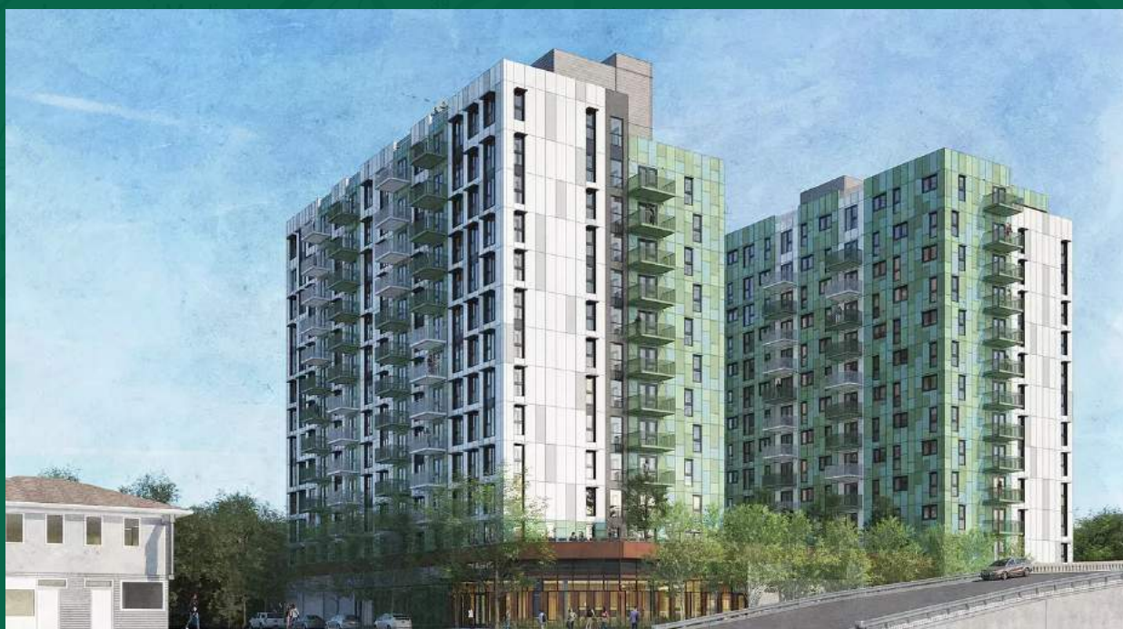
McEvoy Apartments in San Jose, CA, currently under development. It will provide high density housing for working individuals and couples, as well as families with children.

The use of MT housing for 6+ story developments can expand housing near mass transit hubs, such as commuter rail stations and subway/bus lines. In such locations, new MT construction can enable more residents to access mass transit at the same or lower housing price points – an intersection of housing and transit that can improve job mobility and long-term residential quality for residents.