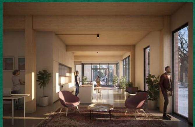
Interior of a model mass timber building.

Supply and use of MT in our region at scale can help us realize critical climate targets. When sourced from healthy, resilient, well-managed forests, widespread adoption of MT would serve as a potent climate mitigation and resilience strategy. This assessment is based on an extensive review of relevant literature (Himes and Busby, 2020), as well as our own modeling. 2 The specific carbon benefits of individual MT projects can be verified, including life cycle analysis that considers the magnitude of emissions reduction from material substitution, C stored in wood products, and in-forest carbon benefits. Adding in-forest impacts, including harvest and sequestration, to carbon analyses of MT projects can further clarify MT's full GHG impacts and potential to enhance those impacts through improved forest practices.