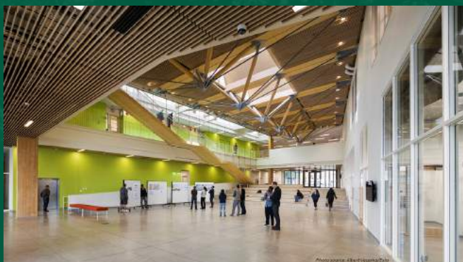
The 17-time award winning Olver Design Building at UMass - Amherst highlights the structural utility and aesthetic beauty of wood.

Mass timber (MT), a familiar yet cutting-edge building technology that can be used to construct a wide variety of climate-smart structures, should be incorporated into the mix of building technologies used in our region. With particularly strong competitive advantages for construction of 6-12 story buildings, MT is ideal for much-needed affordable multi-family and mixed-use residential housing in New York and Boston, as well as smaller cities and communities in Central New England (Vermont, New Hampshire, and Massachusetts) and Eastern New York. MT is an effective climate solution, storing carbon removed from the atmosphere by forests in buildings for the long-term. MT also has lower construction-related greenhouse gas emissions than other building materials while being cost-competitive. Furthermore, our region's forests can supply MT – creating jobs and supporting forest owners and sawmills in our rural communities.